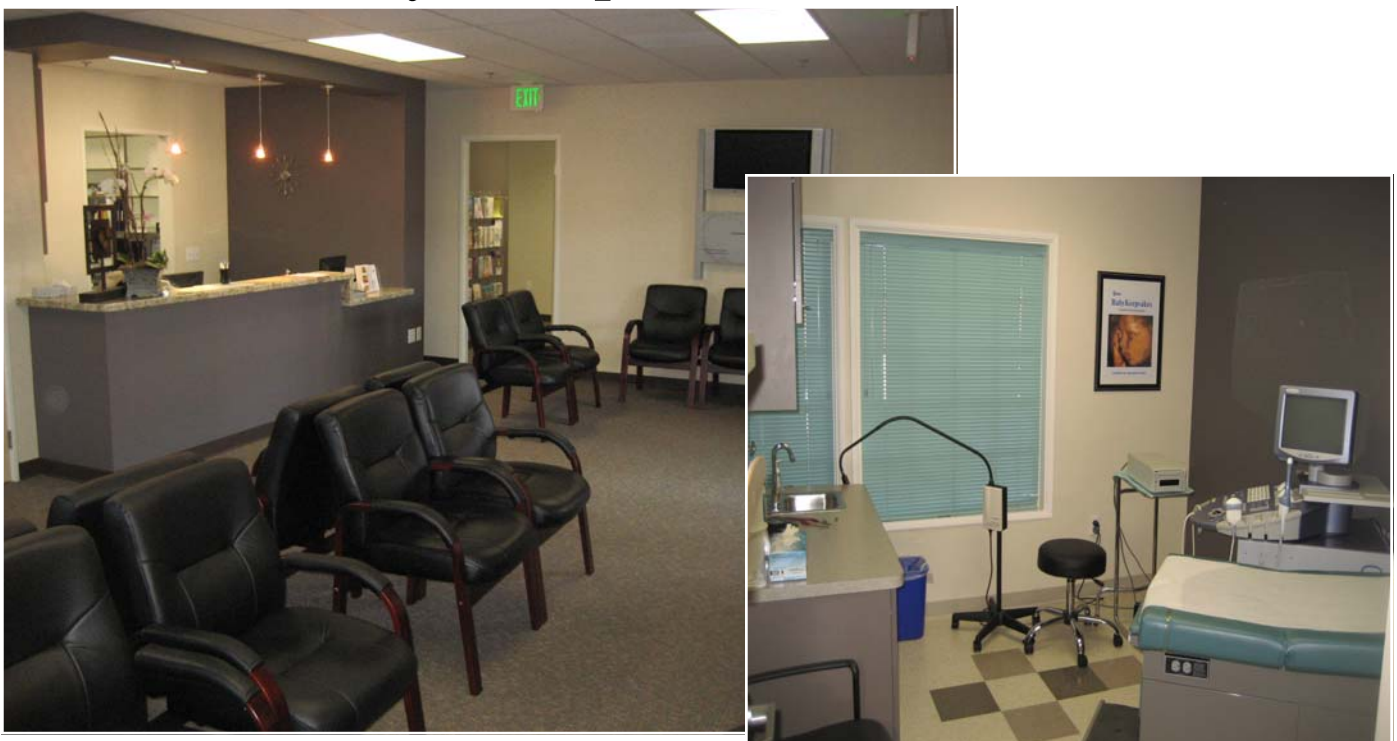
Project Name: Poway Women's Care Square footage : 2560

Location : Rancho Bernardo Ca. Project Value: $ 325,000